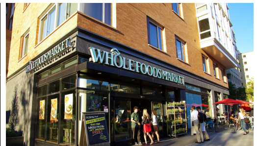
NEARBY RESTAURANTS & SHOPS