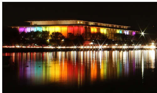
THE KENNEDY CENTER