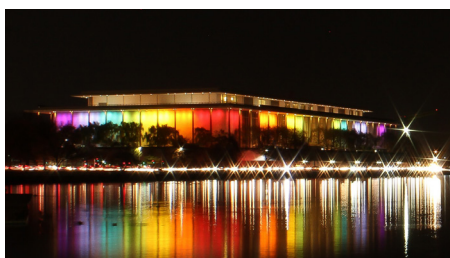
THE KENNEDY CENTER