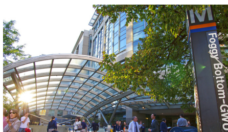
FOGGY BOTTOM METRO STATION