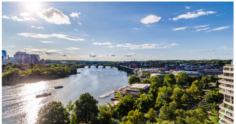
VIEWS FROM THE WATERGATE HOTEL ROOFTOP