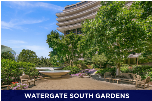
WATERGATE SOUTH GARDENS

WINSTON REAL ESTATE Over 50 Years of Real Estate Experience