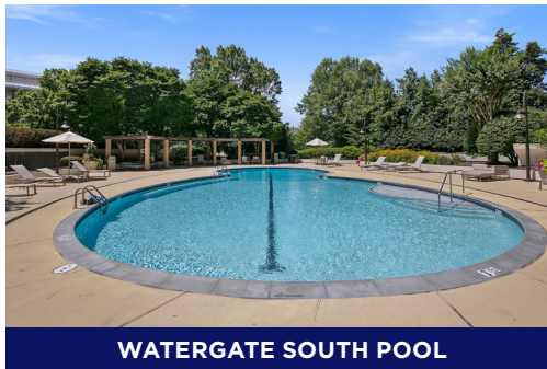
WATERGATE SOUTH POOL