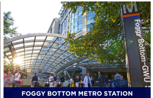
FOGGY BOTTOM METRO STATION