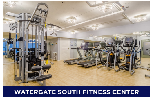
WATERGATE SOUTH FITNESS CENTER