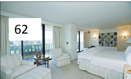
The perfect interior for living and entertaining