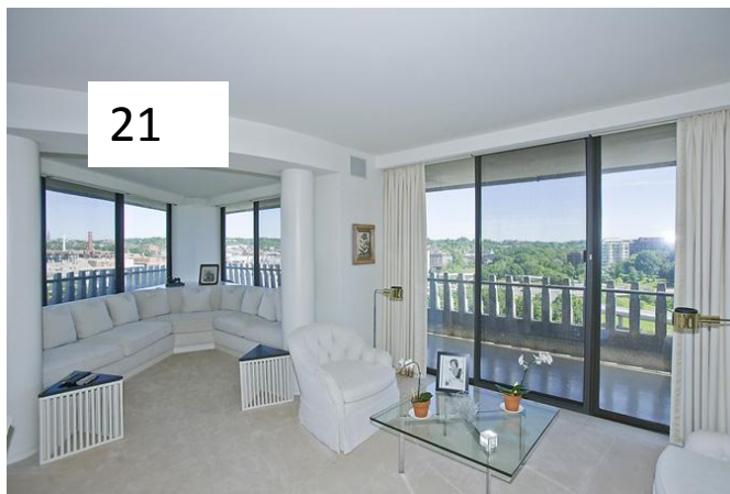
Views that span the Potomac River, Georgetown, the National Cathedral, Roosevelt Island, the Kennedy Center and spectacular sunsets