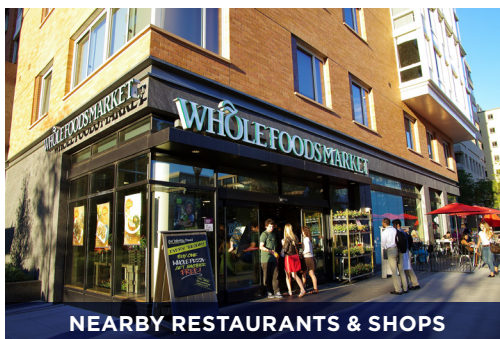
NEARBY RESTAURANTS & SHOPS