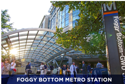
FOGGY BOTTOM METRO STATION