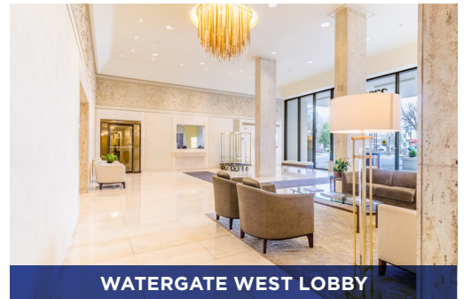
WATERGATE WEST LOBBY