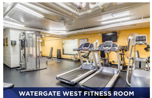
WATERGATE WEST FITNESS ROOM